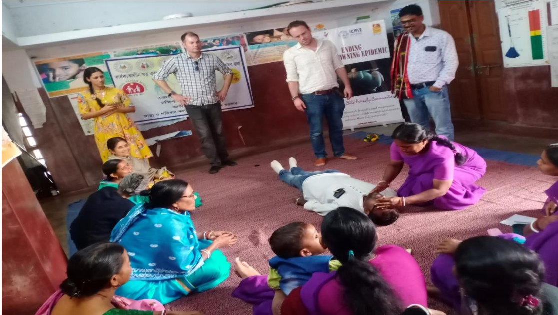
Awareness Training camp on Drowning Prevention with ASHA, ICDS, at BSSK(23/01/23)

Safe and effective implementation depends on programme implementers following the guidance provided in this best practice recommendations in drowning.